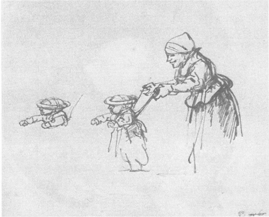
Figure 3: Studie van een vrouw die een kind leert lopen (1646). National Museum Stockholm (B. 706). In: Bob Haak 1976. Rembrandt tekeningen , Amsterdam: Landshoff, afbeelding 46.

horizons and reach for the light of new spaces and experiences! However, it is part of the human rights of the child that she/she should learn walking on his/her own . One can interpret this picture as an illustration of human dignity in interaction. Human dignity is both intrinsic and relational: You see with the eyes of Rembrandt the spirit of dignity in a little child and in an adult sponsor – the latter, with a cheerful attitude of dignity, responding, respecting and sponsoring the dignity of a very young human being.