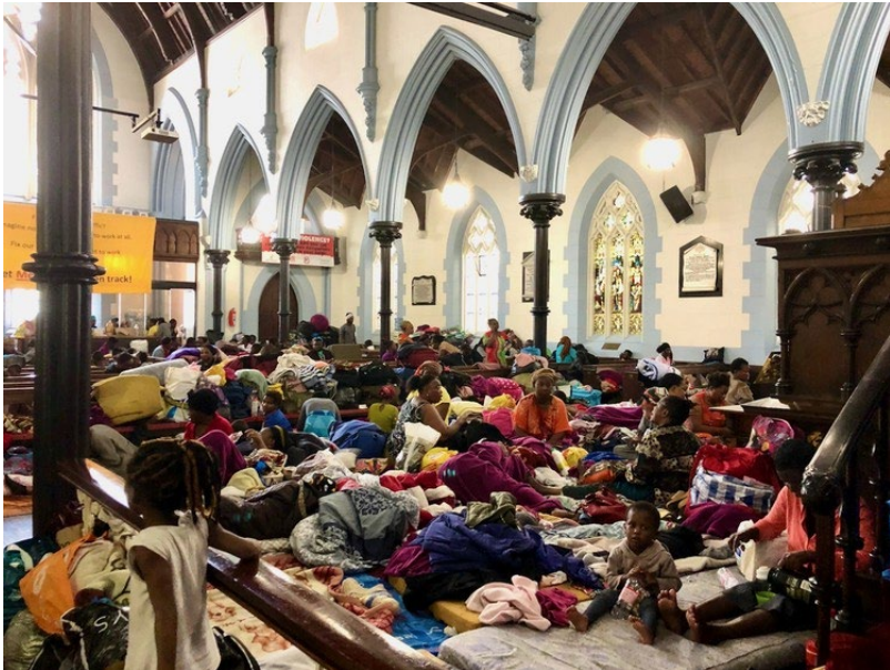
Figure 2: Refugees exposed to xenophobic violence gathering in the Methodist Church. (Refugees in Methodist Church, Cape Town, South Africa, 2019).

During xenophobic violence, many foreigners, displaced refugees and illegal migrants found safety and care within the church in downtown Cape Town. The picture illustrates exactly what is meant by the summoning to become havens of safety and healing: Hospitable xenodochia . However, appropriate theory is time and again met by painful resistance and the disillusionment that reality is different than the paradigmatic idea behind it. There occurred an outbreaking of violence within the church building of the Methodist Church , and after the Evangelical Lutheran Church in Athlone (Cape Flats) gave shelter to displaced people, some of them broke into the church and stole costly liturgical objects while looting the place. This very disillusioning event proves the fact that compassionate being-with is not about ‘success stories’ of performed truth but narratives of even painful disillusionments.